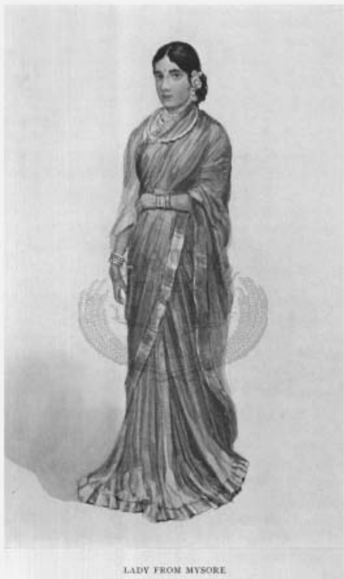
LADY FROM MYSORE